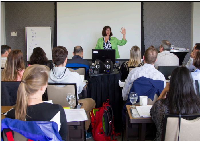
Construction 101 continues to sell out with 134 students since 2015.