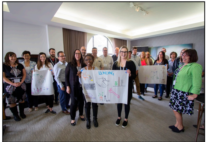
13 Public Owners have attended Construction 101, including the Cities of Langford, Nanaimo, Duncan, and Victoria; Defence Construction Canada; Partnerships BC, Island Health & the Capital Regional District.