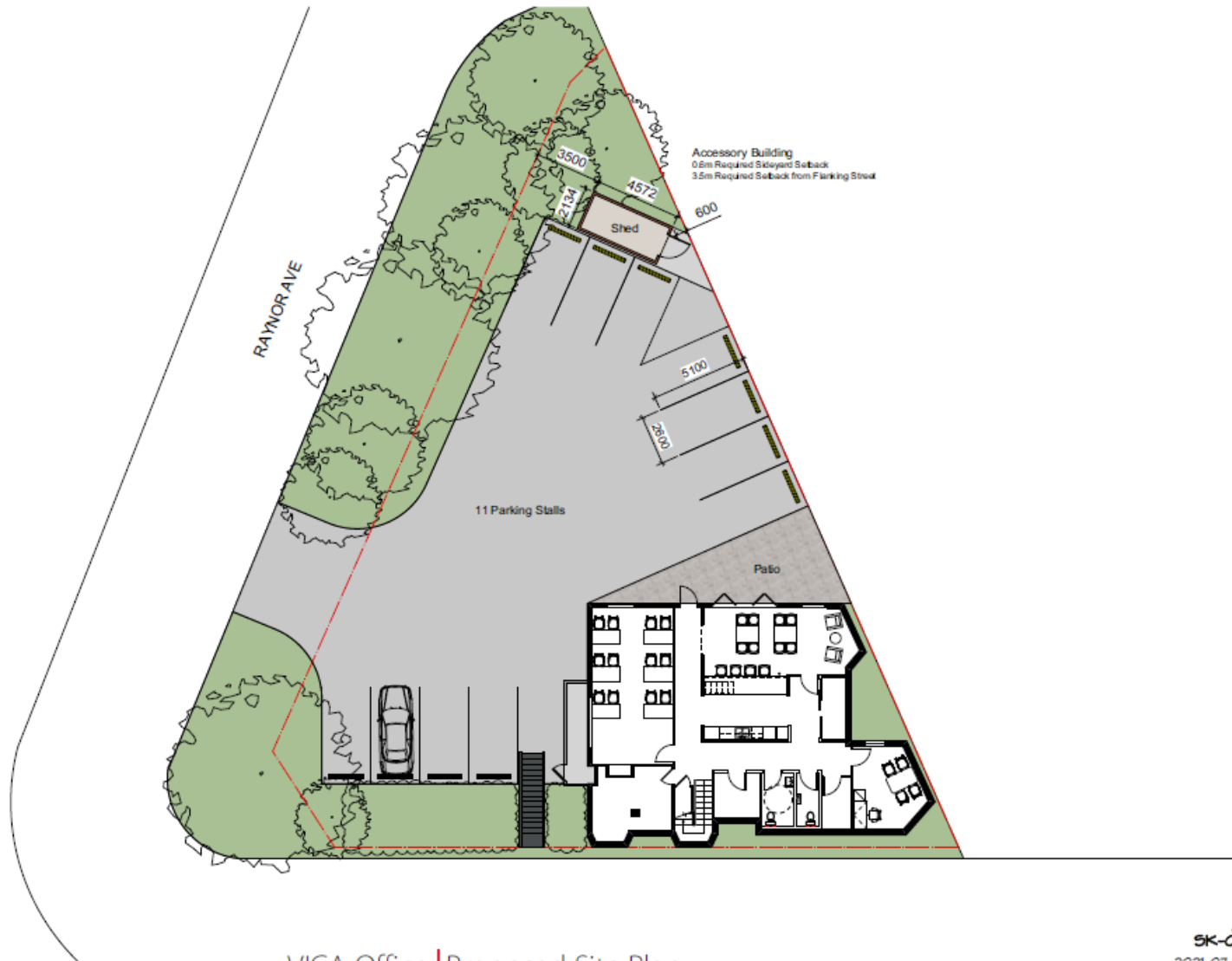
VICA Office | Proposed Site Plan