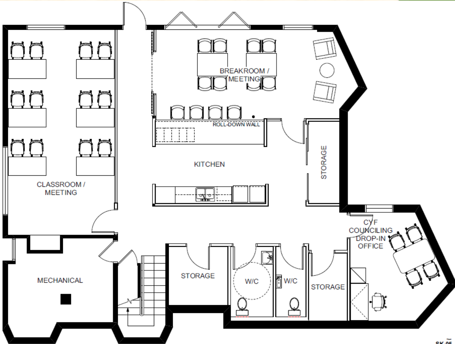
VICA Office | Proposed 1st Floor Layout Alternate Furniture

SK-05 2021-07-12 1:55 2021522 numberTEN architectural group 266, 10100th Ave SW Everett, WA 98203 T 425.352.2100 F 425.352.2101 www.numberTEN.com info@numberTEN.com number 10